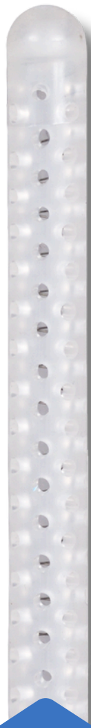
ViSiGi® for Sleeve Gastrectomy